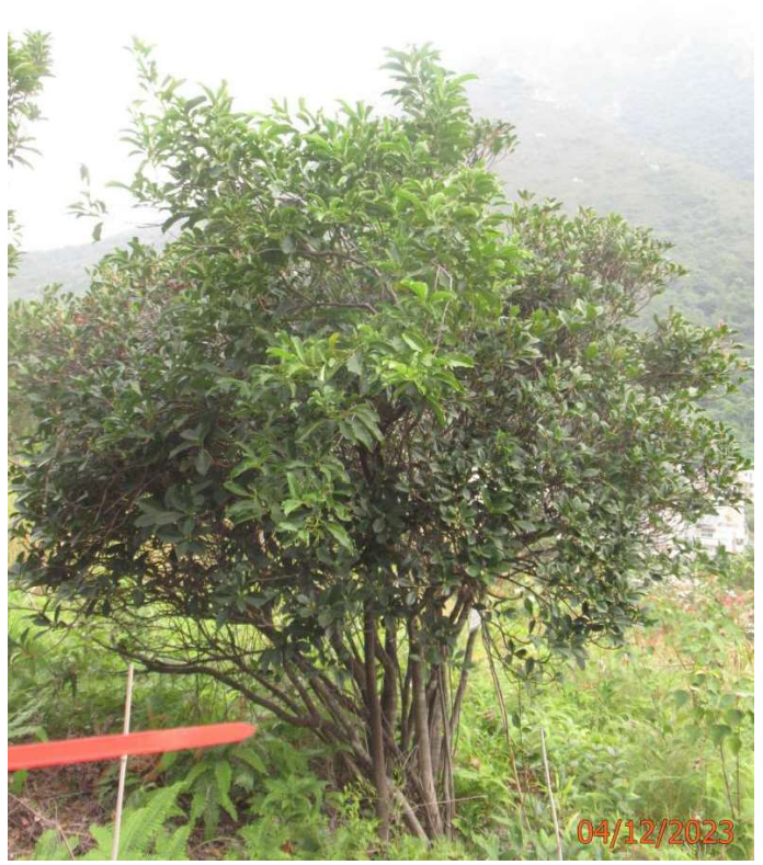
R04 Enkianthus quinqueflorus Newly observed in November 2023