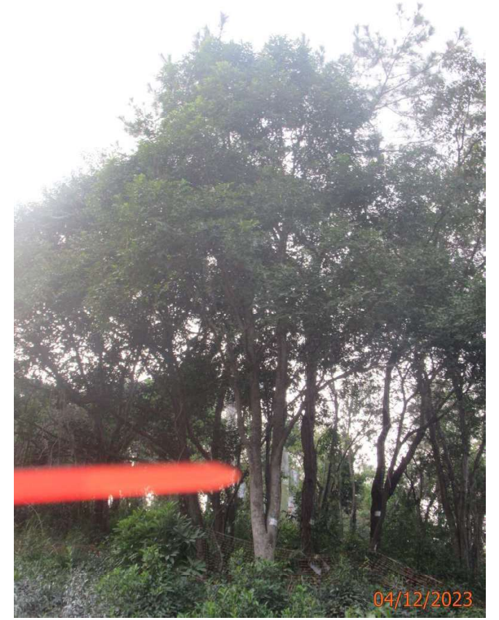
WLH_T047 Aquilaria sinensis Newly observed in November 2023